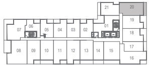
FLOORS 5 & 6