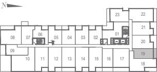
FLOORS 2 & 3