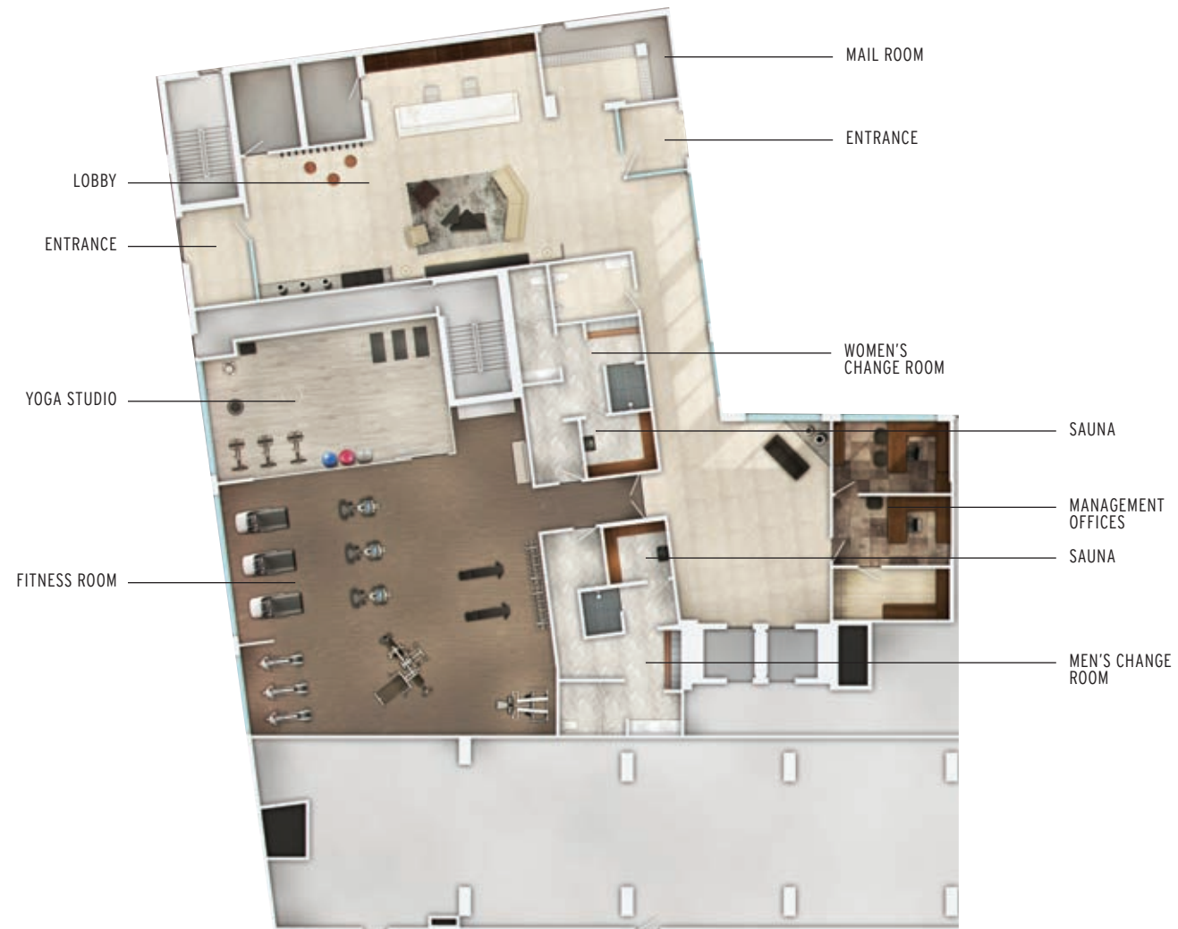
Illustration is artist's concept only. Actual may vary.