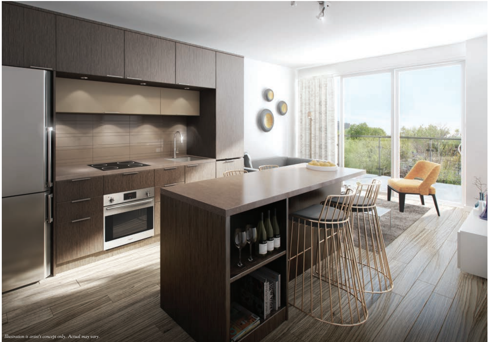
Illustration is artist's concept only. Actual may vary.