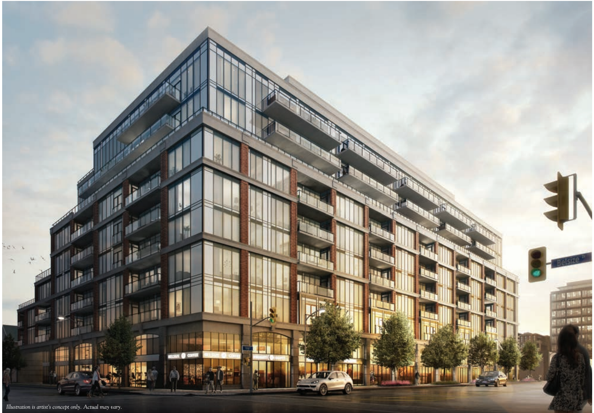
Illustration is artist's concept only. Actual may vary.