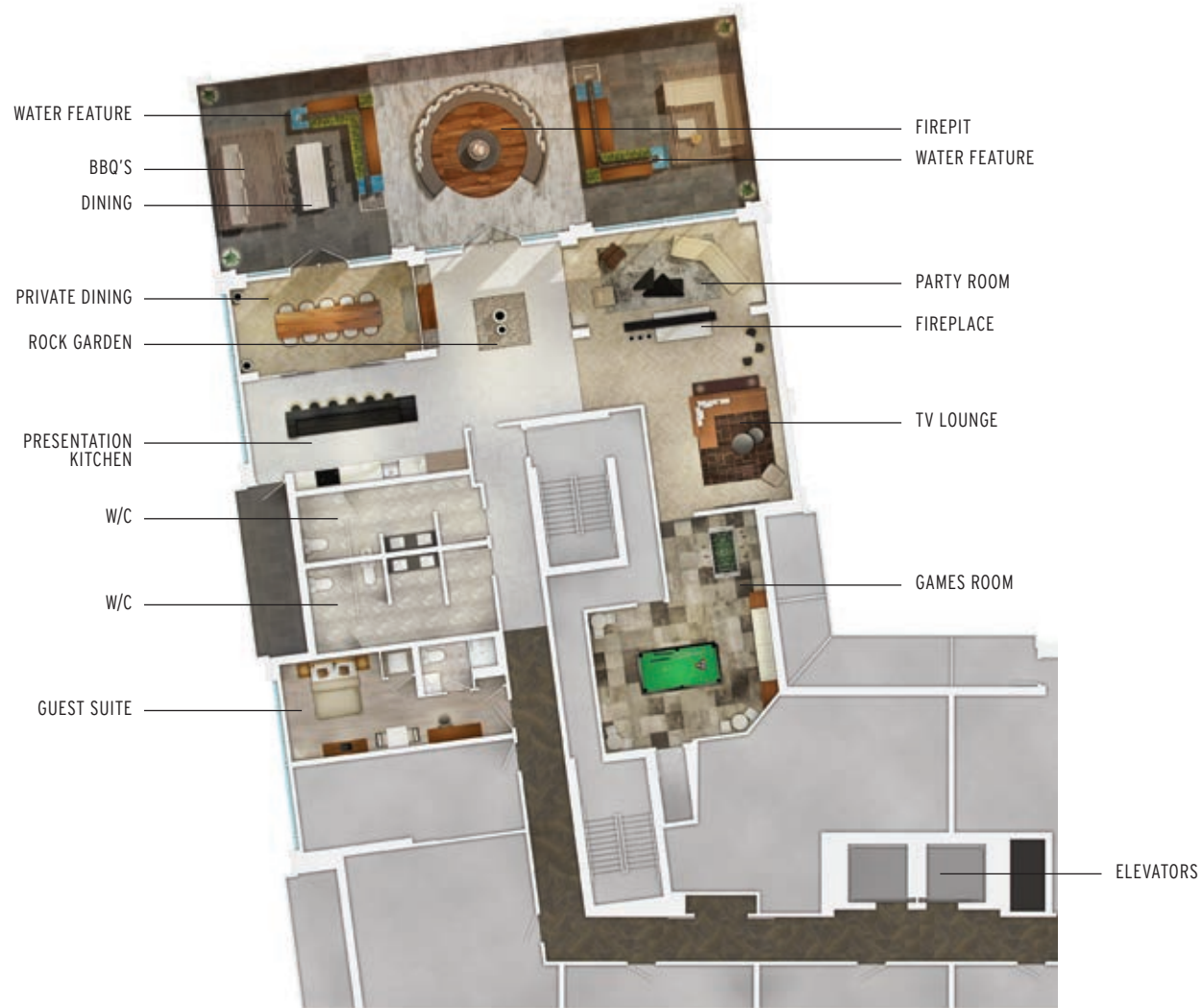
Illustration is artist's concept only. Actual may vary.