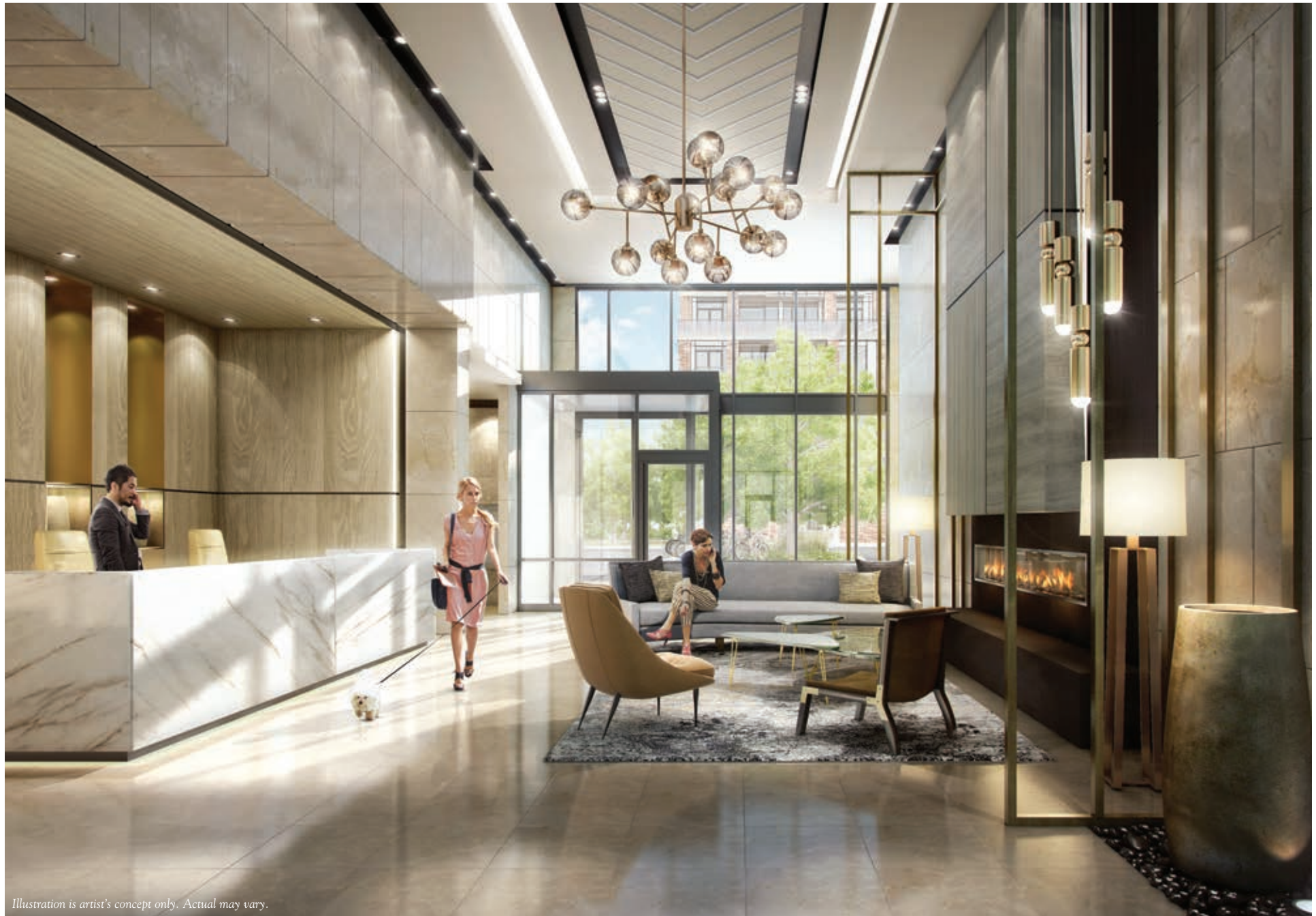
Illustration is artist's concept only. Actual may vary.