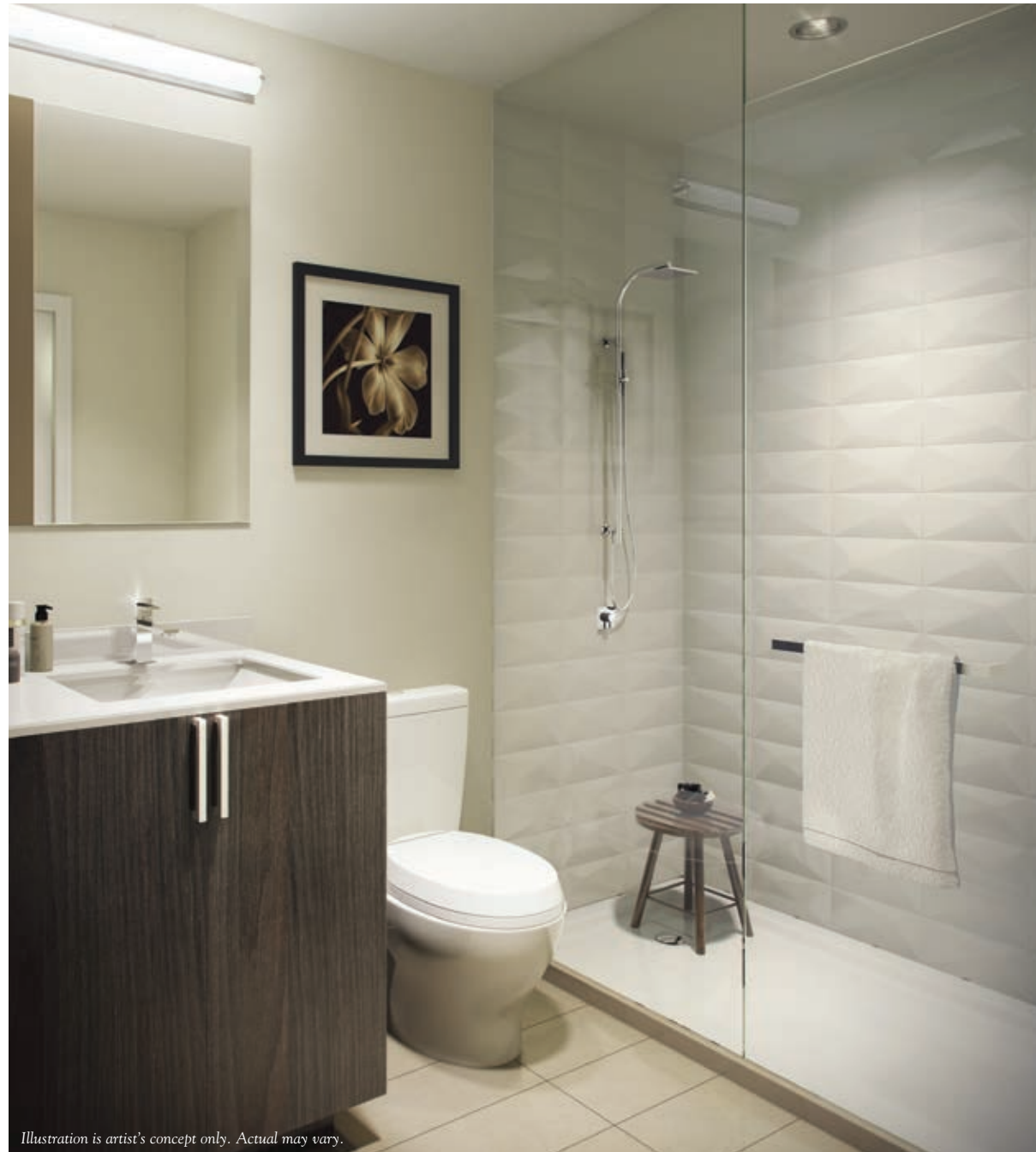
Illustration is artist's concept only. Actual may vary.