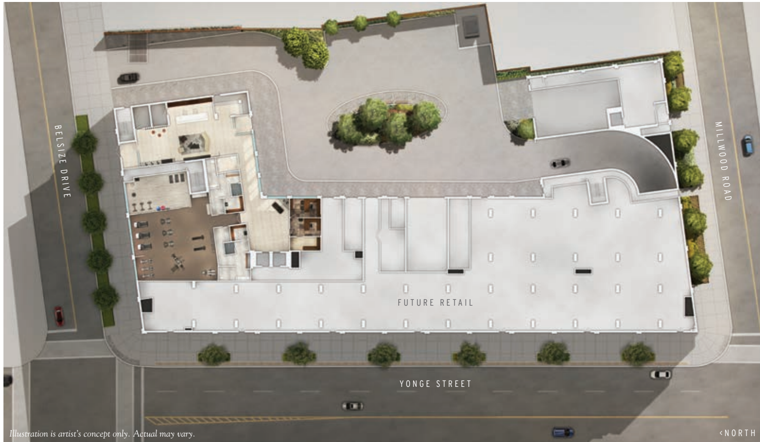
Illustration is artist's concept only. Actual may vary.