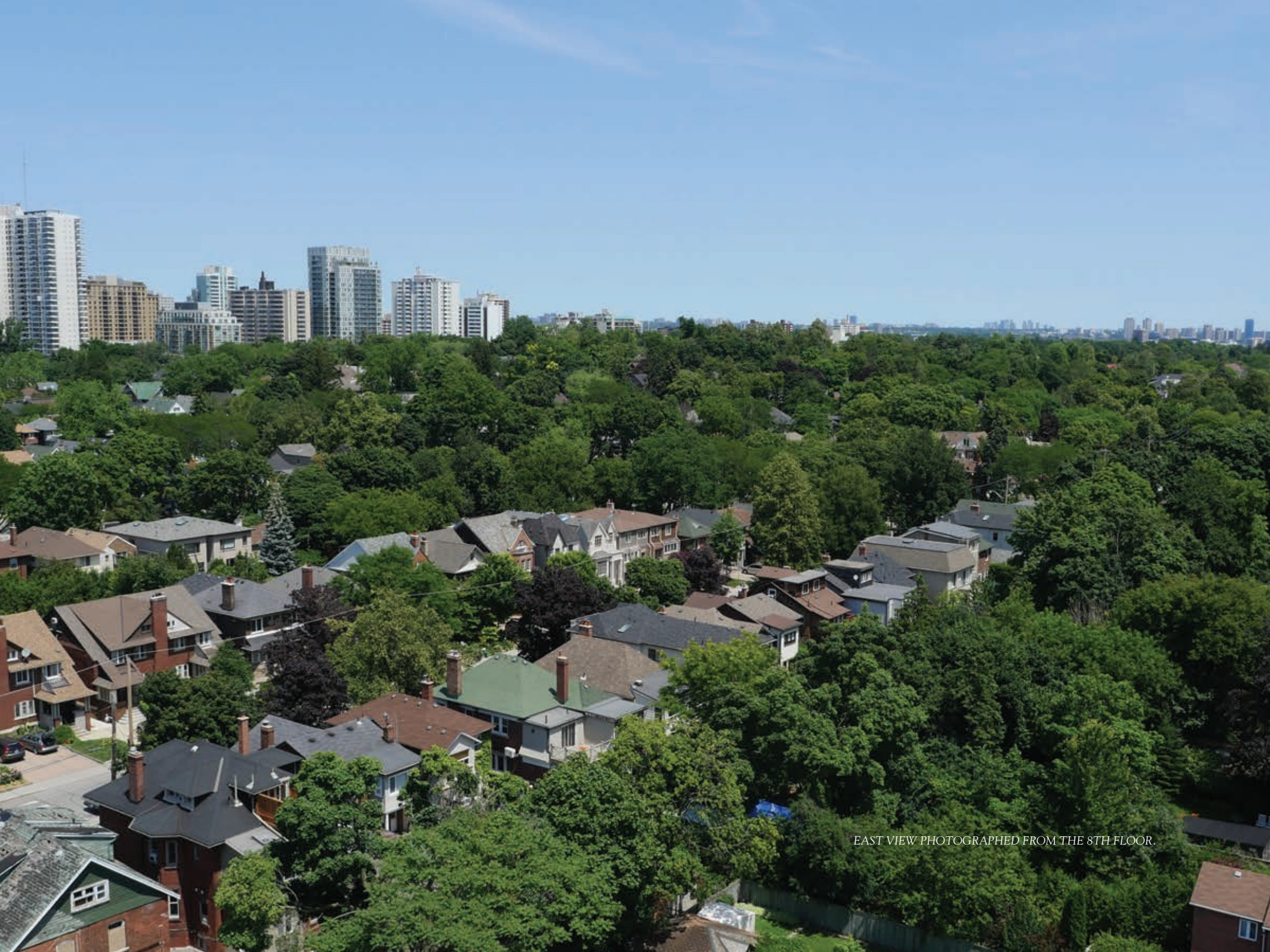
EAST VIEW PHOTOGRAPHED FROM THE 8TH FLOOR.