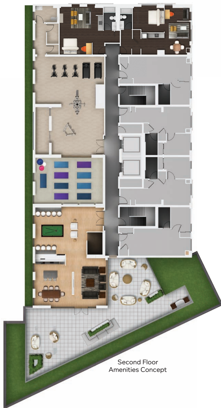
Second Floor Amenities Concept

NOTE: The photographs and illustrations do not necessarily depict actual features but represent similar quality and design that will be offered at On The Go Mimico. Features and finishes may vary by suite design. See sales associate for details. Materials, specifications and floorplan are subject to change without notice. E.&O.E